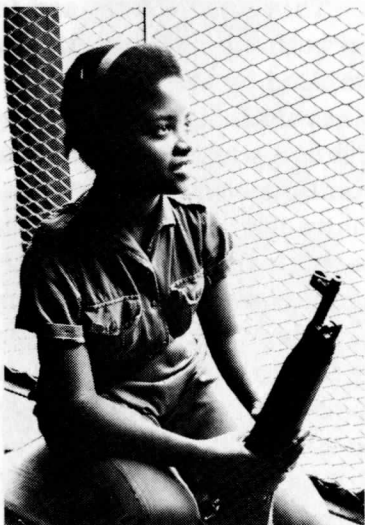
Cuban militia girl

A black political party is needed to effectively fight for control of our communities. Such a party can fight by any means necessary for the liberation of black people--at the ballot box, on the job, in the streets. The only real way to